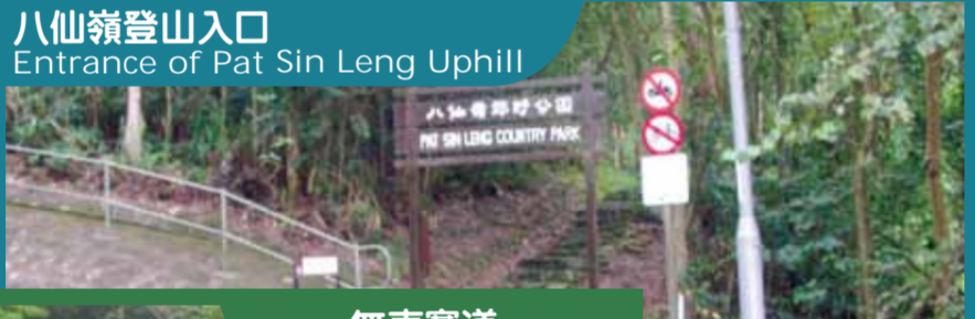
八仙嶺登山入口 Entrance of Pat Sin Leng Uphill