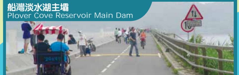
船灣淡水湖主壩 Plover Cove Reservoir Main Dam

"本賽道是香港唯一的 綠色零排放" "Zero Emission Course"