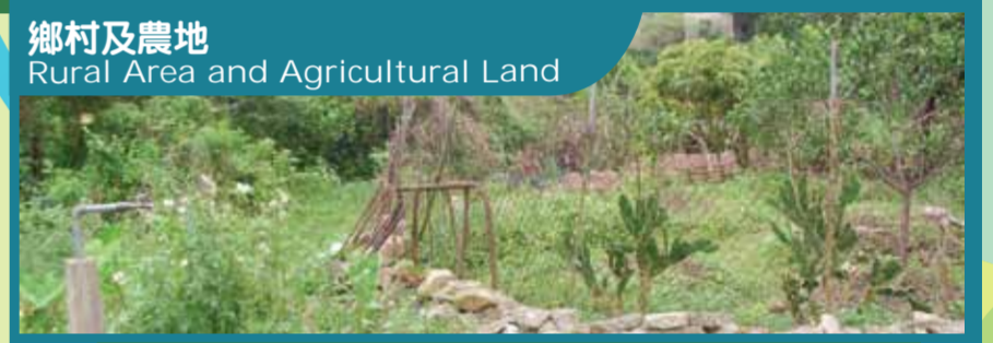
鄉村及農地 Rural Area and Agricultural Land