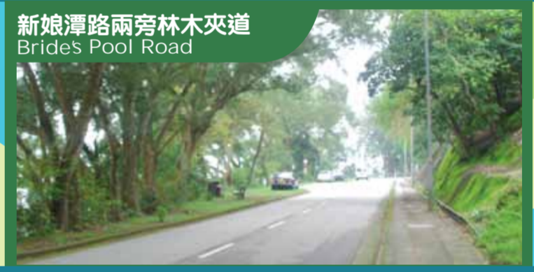
新娘潭路兩旁林木夾道 Brides Pool Road