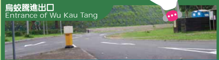
烏蛟騰進出口 Entrance of Wu Kau Tang