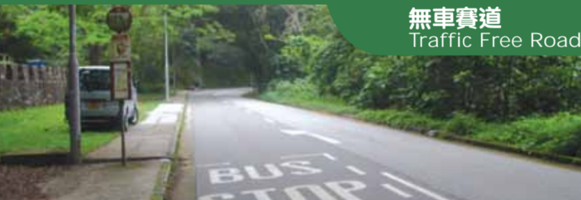
無車賽道 Traffic Free Road