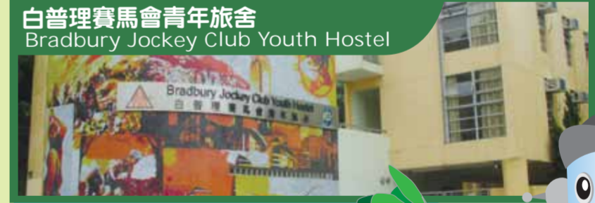
白普理賽馬會青年旅舍 Bradbury Jockey Club Youth Hostel