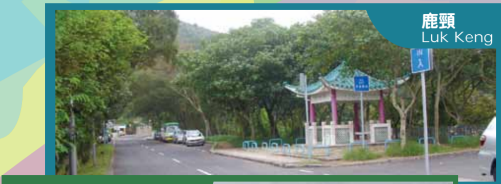
鹿頸魚池 Luk Keng Fish Ponds