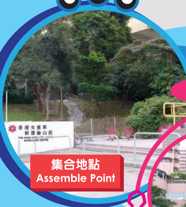
集合地點 Assemble Point

Large number of environmental souvenirs at discounted SALE