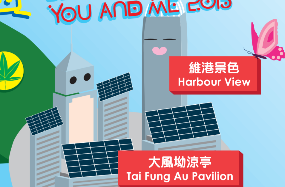
維港景色 Harbour View