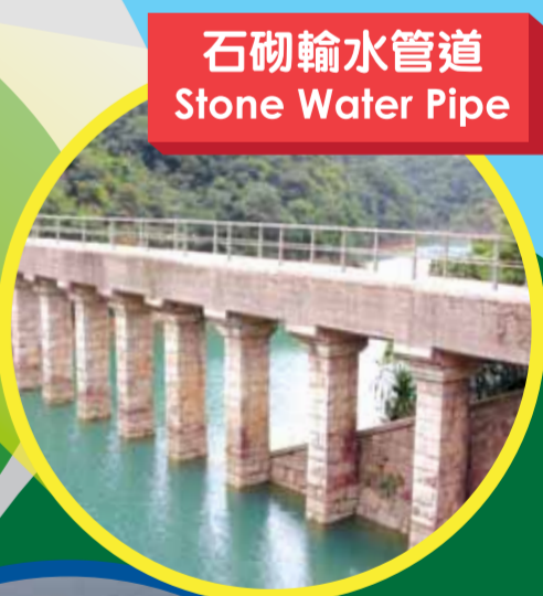
石砌輸水管道 Stone Water Pipe