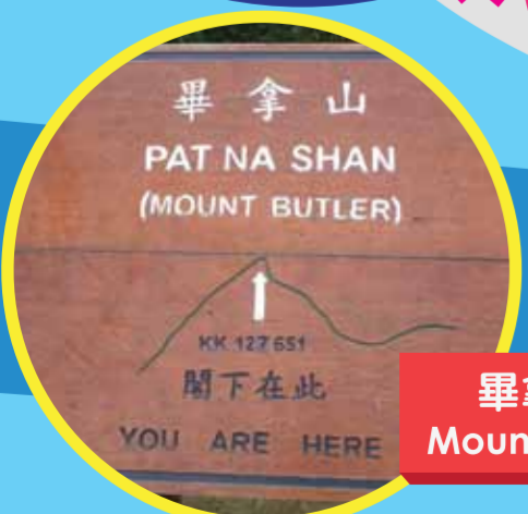
畢拿山 Mount Butler