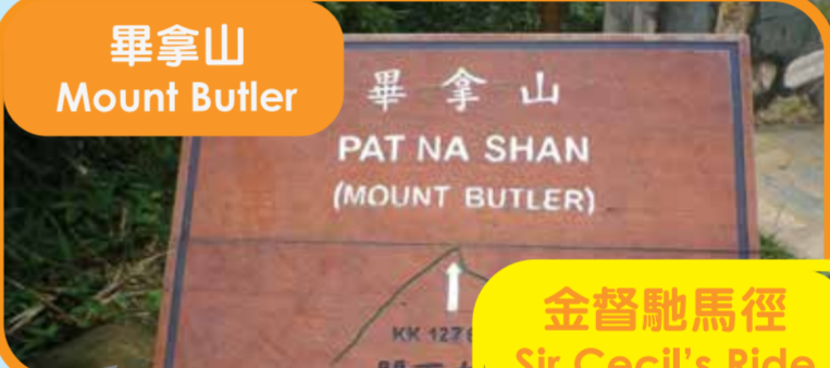
金督馳馬徑 Sir Cecil's Ride